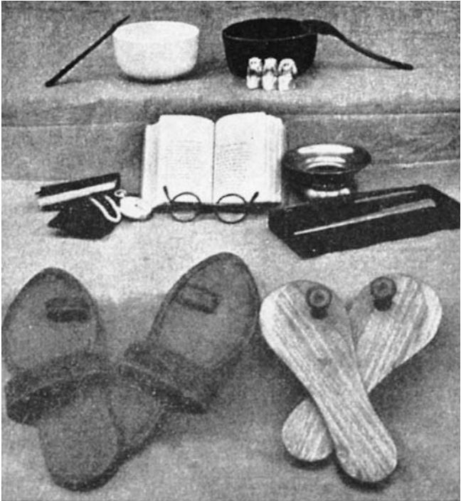
7. Gandhi's worldly possessions