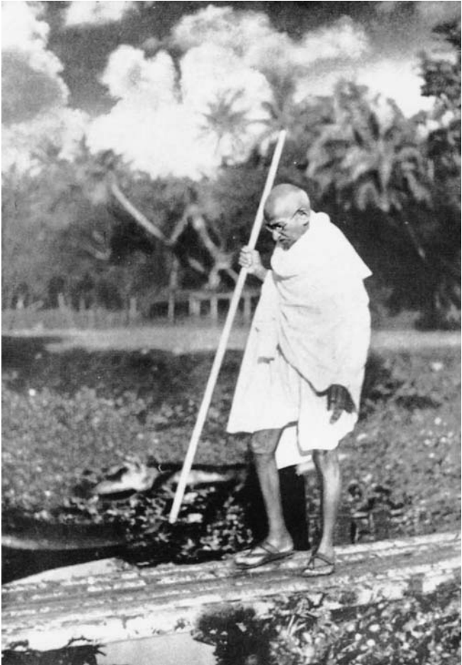
4. Gandhi walking through the riot-torn areas of Noakhali, late 1946