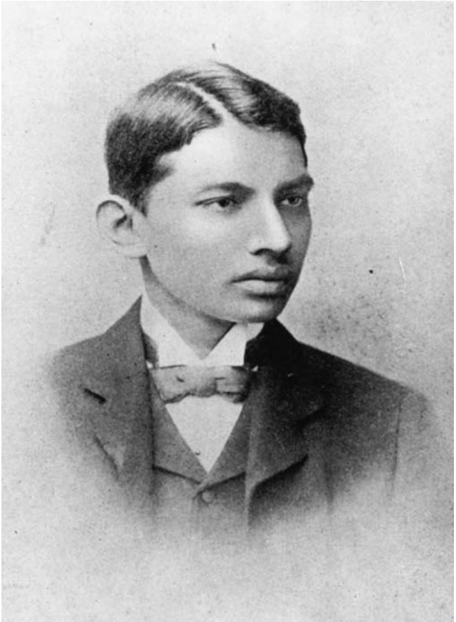
2. Gandhi as a law student in London in 1890