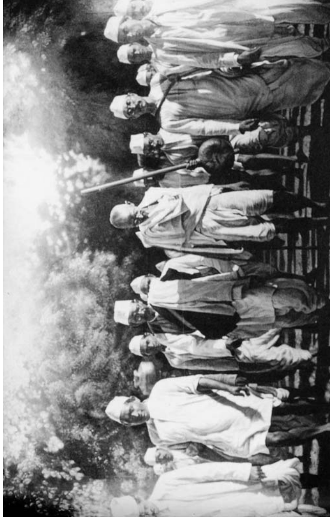
3. Gandhi on the Salt March, 12 March 1930